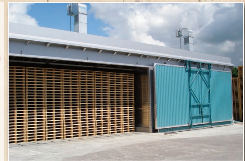
2 Kilns each holding 1225 Euro pallets

Rowan House, Burnham Business Park, Burnham On Crouch, Essex. CMO 8TE Tel: 01621-785935 Fax: 01621-785937 e-mail: kilnservices@btconnect.com