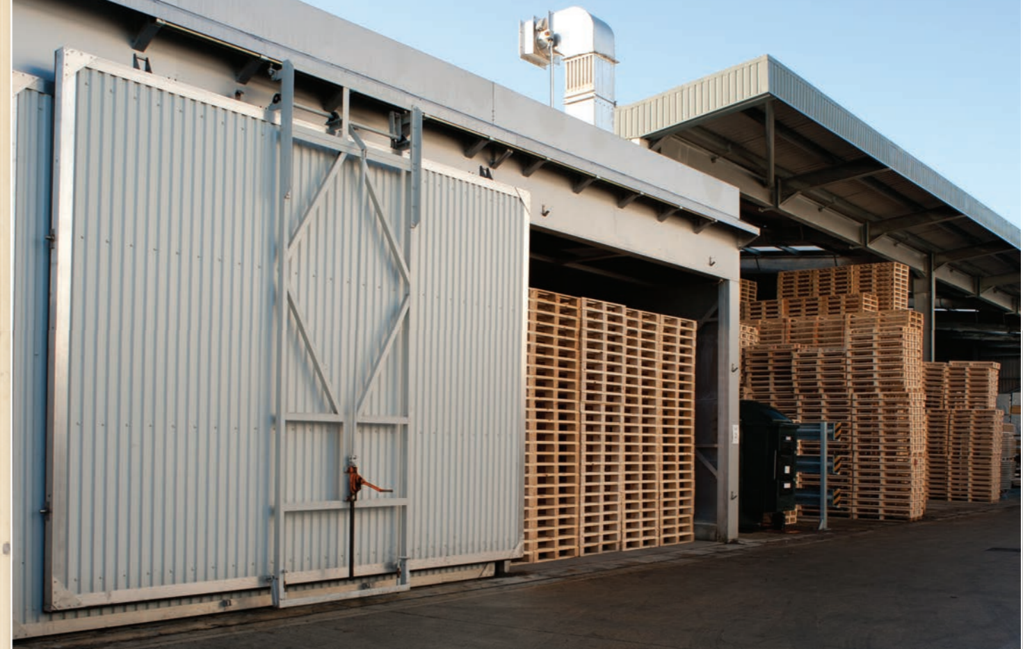
2 kilns with the capacity of 700 Euro pallets each