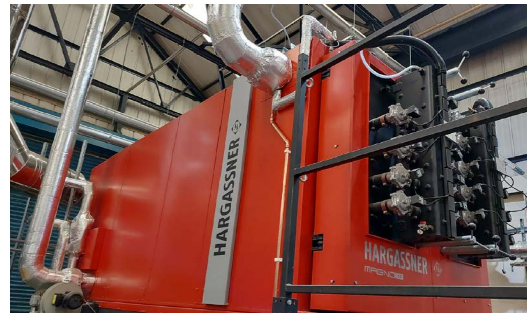
Hargassner Magno-SR 995 kW boiler installed at Nicklin Transit Packaging in Wednesbury for wood treatment kilns, space heating and hot water (left).

For more information and to arrange a site survey contact AFS Biomass Ltd on: t: 0161 302 2851 e: info@afsbiomass.com