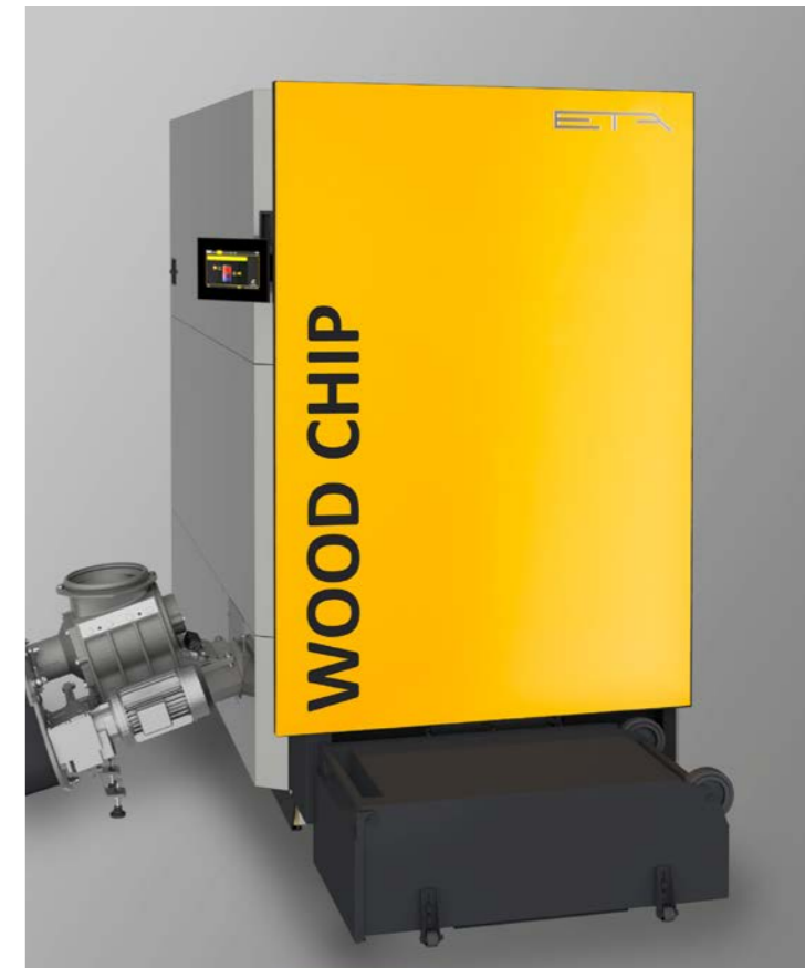
ETA eHack 199 kW boiler installed at Avon Joinery in Rugby for space heating and hot water in the factory and offices (above).

Whether a small to medium size business needing 130 kW of heat or a large factory with 1 MW of demand, AFS Biomass can design, install and maintain RHI accredited biomass systems to satisfy that demand.